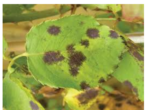
Figure 2: Bacterial Disease Symptoms