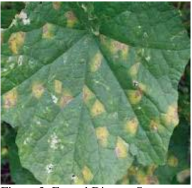
Figure 3: Fungal Disease Symptoms

Plant leaf diseases, those caused by fungus are discussed below and shown in Fig. 3. E.g. Late blight caused by fungus. It first appears on lower, older leaves like graygreen spots, water- soaked. When fungal disease matures, these spots darken and then white fungal growth forms on the undersides.