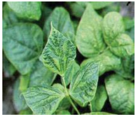
Figure 1: Viral Disease Symptoms

Among all plant leaf diseases, those caused by viruses are the most difficult to diagnosis. Viruses produce no telltale signs that can be readily observed and often confused with nutrient deficiencies and herbicide injury. Aphids, leafhoppers, whiteflies and cucumber beetles insects are common carriers of this disease, e.g. Mosaic virus, and look for yellow or green stripes or spots on foliage, as shown in Fig. 1. Leaves might be wrinkled, curled and growth may be stunted [7].